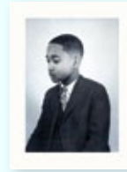
Erica Allen, Untitled Gentleman #32 , 2010. Archival pigment print on Entrada photo rag paper, signed and numbered by the artist. Dimensions: 8.5" x 11". Edition of 25.