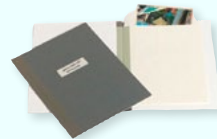
Allen Ruppberg, House of Cards , 2007. Acrylic-coated 10" x 13" archival binder and envelope containing 10 laminated cards printed in full color on both sides. Signed and numbered by the artist. Edition of 50.