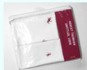
Robert Therrien, Untitled , 2008. A set of four 20" x 20" napkins and a 54" by 54" tablecloth, each a unique object silkscreened by hand by the artist. Edition of 25.