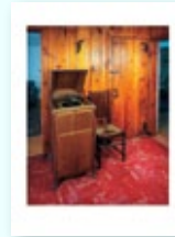
Sarah Malakoff, Untitled Interior , 2007. Inkjet print on premium luster paper, signed and numbered by the artist. Dimensions: 9.5" x 13". Edition of 50.